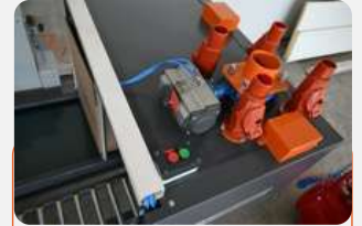
Improved aspiration connection system