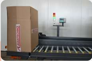
Control scales with traffic-light indication for correct filling