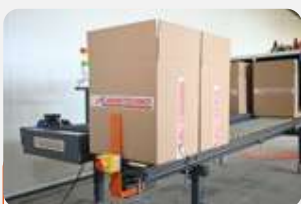
Limiter at the end of the roller conveyor