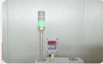
Rotating controller of the main scales