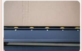
Improved design of the roller conveyor