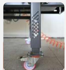
Adjustable line height from 560 mm to 700 mm