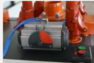
Valve position indicator