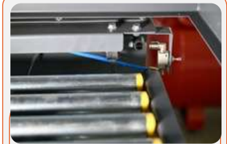
Blowing system for prevention of sensors dusting