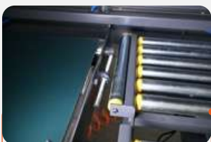
Improved design of the main scales