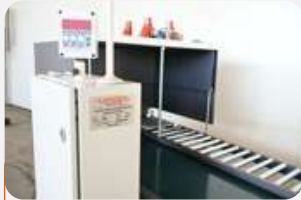
Advanced automated line control system